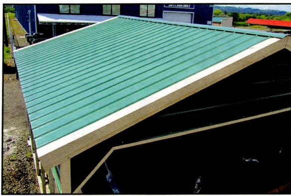
Option: Gable Ends