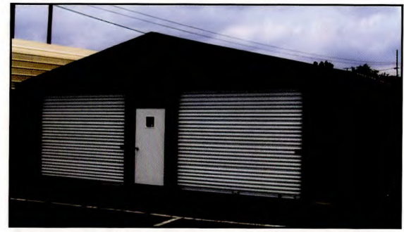
Option: A-Frame Style w/Vertical Metal

West Coast Metal Buildings, Inc. 5073 Dallas Hwy. • Salem, OR 97304